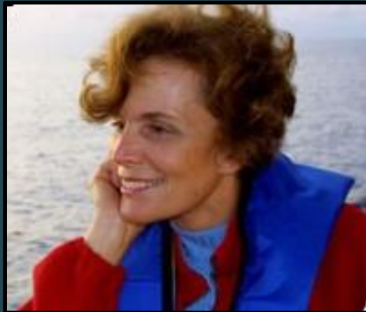
Dr. Silvia Earl Explorer, President MISSION BLUE