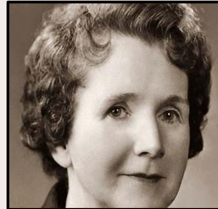
Rachel Carson Marine biologist , writer, and conservationist