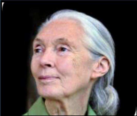
Dr, Jane Goodall Founder, Jane Goodall Institute