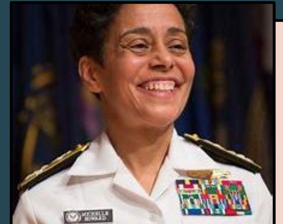
Michelle J. Howard U.S First Female 4 Star Admiral