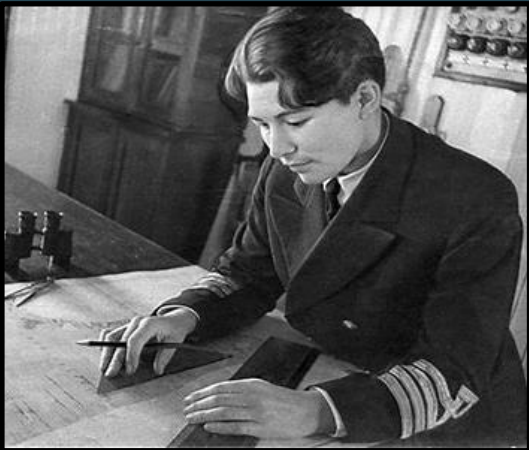
Anna Ivanovna Shchetinina World's First Female Captain