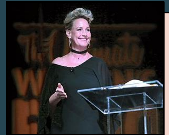
Erin Brockovich Environmental Activist