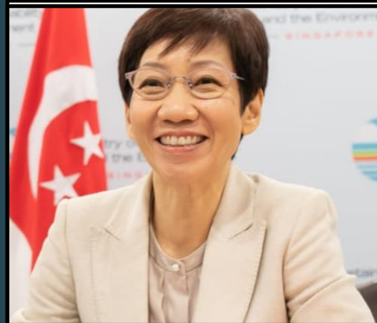
Grace Fu Minister, Ministry of Sustainability & Environment